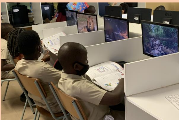
ICT Class in Session.

Even though Covid-19 Regulations have been relaxed in relation to sports, Inter-school competitions remain suspended until further notice. Competitions will be in-house only (inter house competitions).