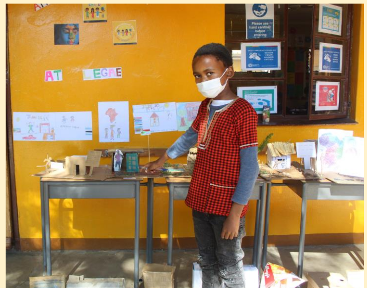
Creative Minds: Using Recycled Materials (2020 Day of the African Child)

Parents are encouraged to engage with their children’s class teachers where there is a need for the children to attend remedial lessons.