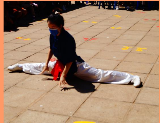
Chinese Martial Arts Demonstration