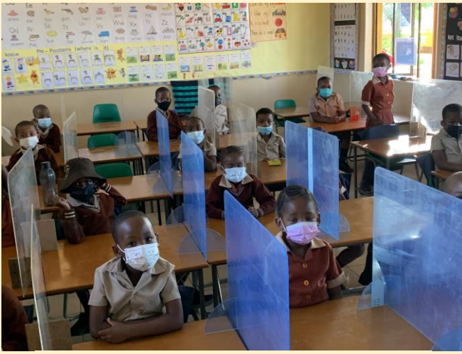
Welcome Standard 1 Class of 2022!