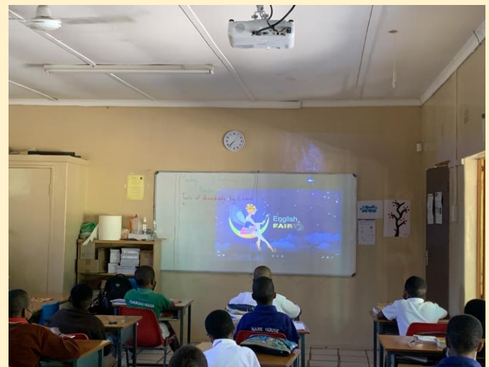
Improved Teaching and Learning Strategies by using ICT